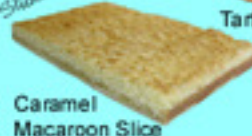
Caramel Macaroon Slice