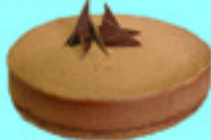
Baked Hot Choc Cheesecake