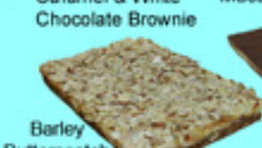
Barley Butterscotch Chew Slice