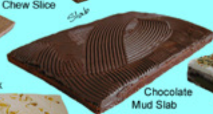
Chocolate Mud Slab