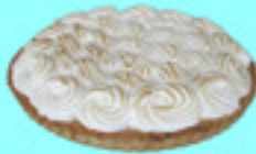
Lemon Meringue Pie