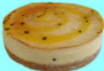
Baked Passionfruit Cheesecake