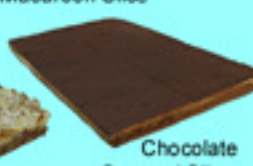
Chocolate Caramel Slice