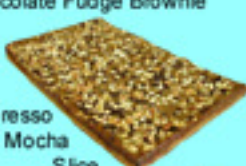
Espresso Mocha Slice