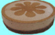
Chocolate Mousse Cake