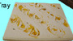
Tropical Cheesecake Tray

Products subject to change. Photos not to scale.