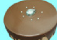
Luzerner Chocolate Gateau