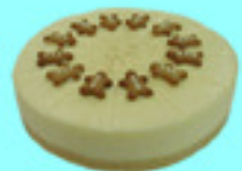
Lemon Coconut Cheesecake