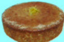
Flourless Lemon Citrus Cake