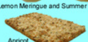
Apricot Muesli Slice