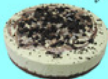
Mint Condition Cheesecake