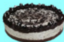
Cookies 'n Cream Cheesecake