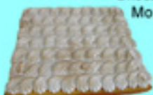
Lemon Meringue Tray