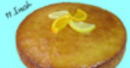
Orange and Lemon Cake