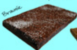
Chocolate Fudge Brownie