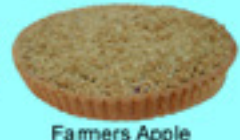
Farmers Apple Blueberry Crumble Flan