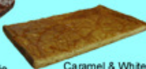
Caramel & White Chocolate Brownie