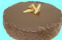
Hot Fudge Cake