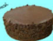
7" Mud Cake